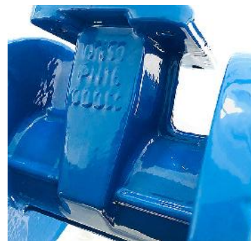
Face to face dimension by DIN 3202 F4