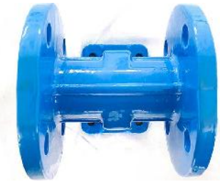
The structure wears Pressure 2.4 mpa