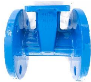
Paint thickness >300\mu\text{m}