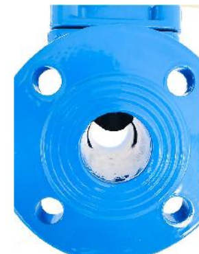
The inner hole is smoothly casted and painted